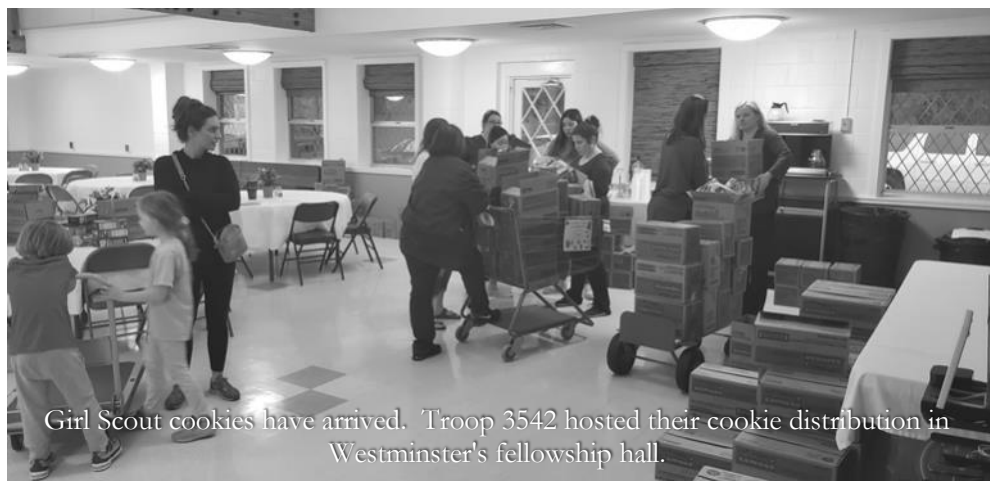
Girl Scout cookies have arrived. Troop 3542 hosted their cookie distribution in Westminster's fellowship hall.